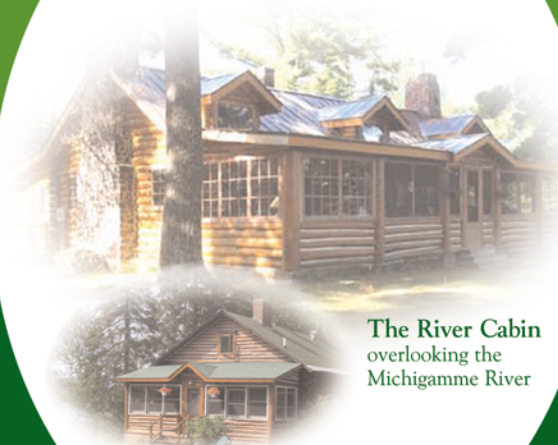
The River Cabin overlooking the Michigamme River